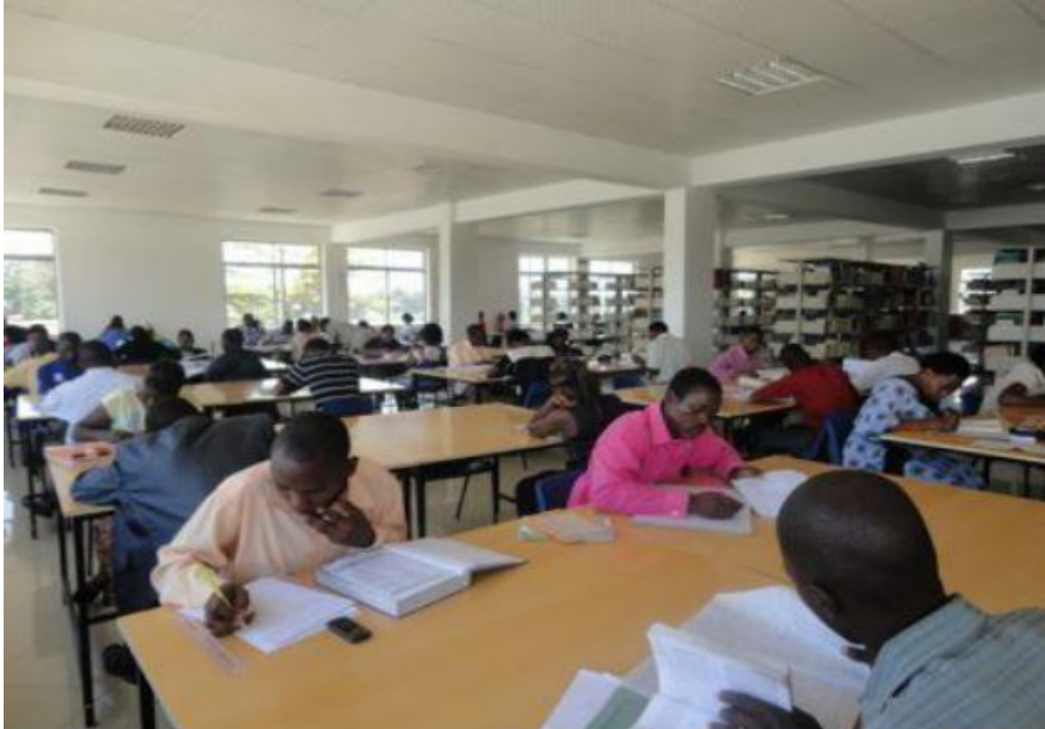
Students diligently studying in a pleasant atmosphere