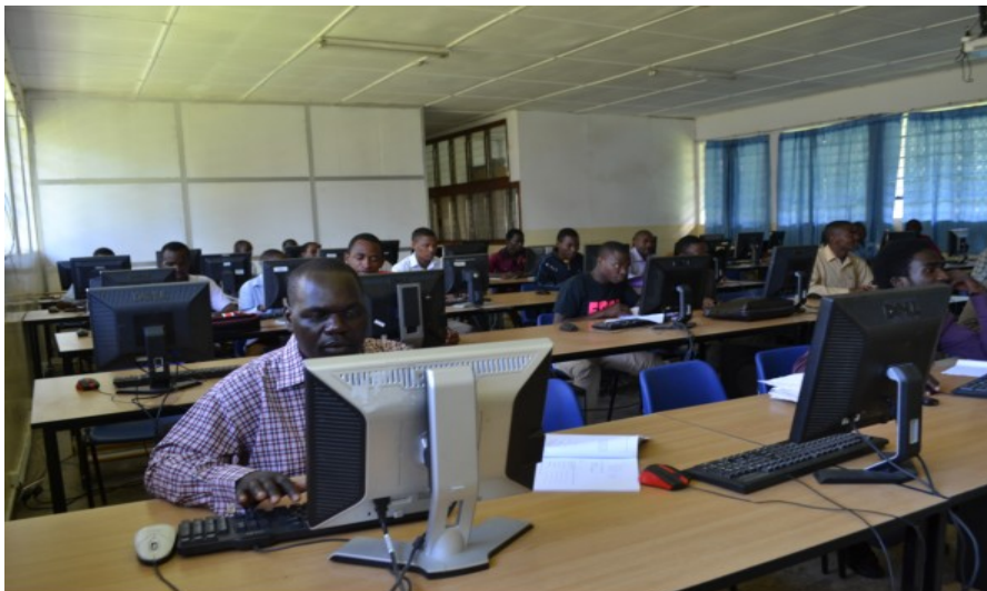
Students in a class applying the technological knowledge practically