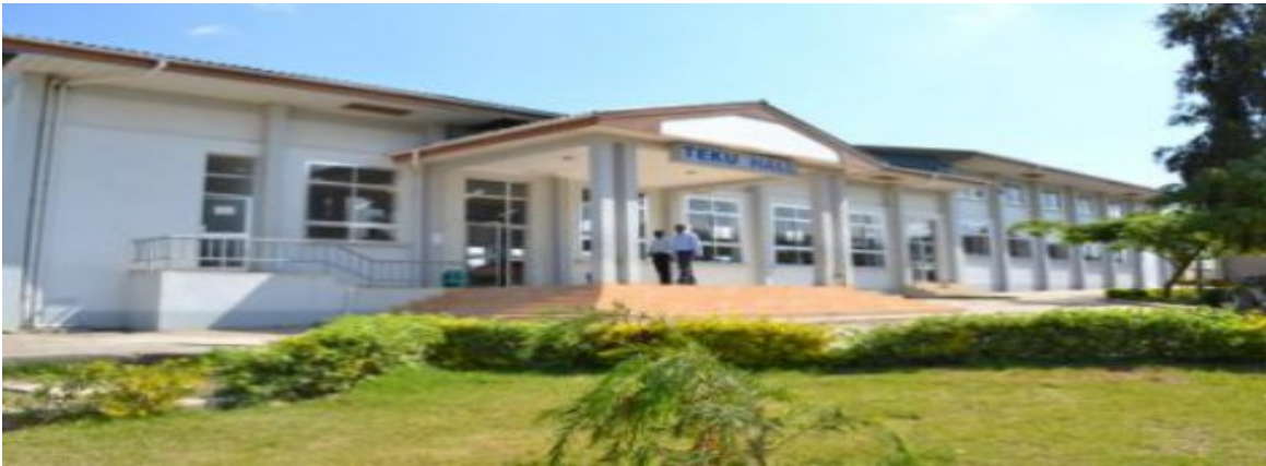
An enticing environment for learning and recreation