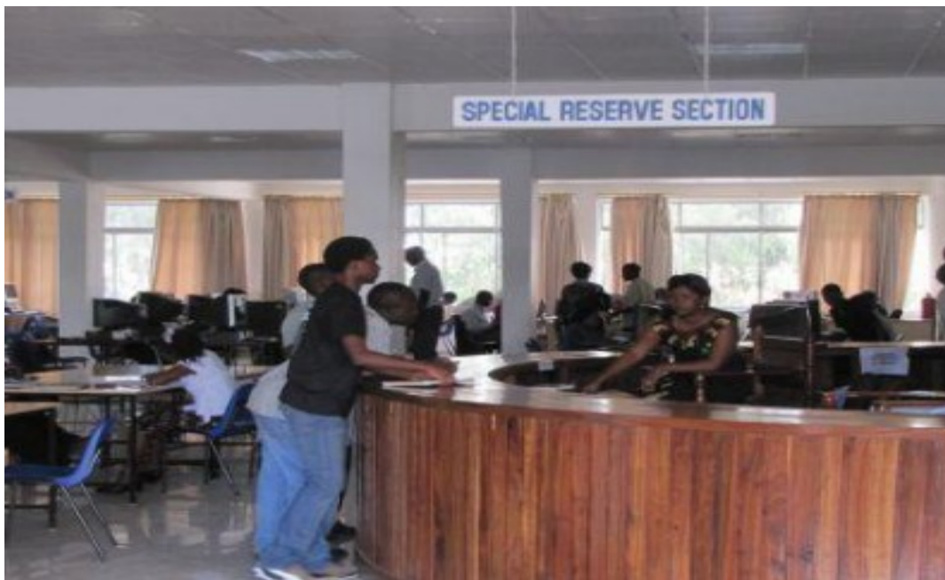
Students making effective use of the Library services